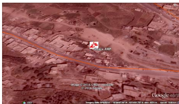
This aerial photo shows Shiara hospital's central location in the town

The "Razeh suburban hospital" (" Mustashfa Razeh el- Rifi ", hereinafter "Shiara hospital") is a small MoH district hospital located next to the main marketplace of Shiara, on the main road passing through the town. People from all over Razeh district come to Shiara to visit the market place. Shiara hospital is the only hospital to serve the population of 70,000 in the Razeh district, but also is the only one available for the other four surrounding districts. In recent months, there have been 2-3 private hospitals that have opened up in Shiara, presumably to meet emerging medical needs among those families who can afford to pay higher fees. 7 In the area surrounding Shiara hospital, the market place, houses and petrol stations are frequently hit by airstrikes and rocket fire.