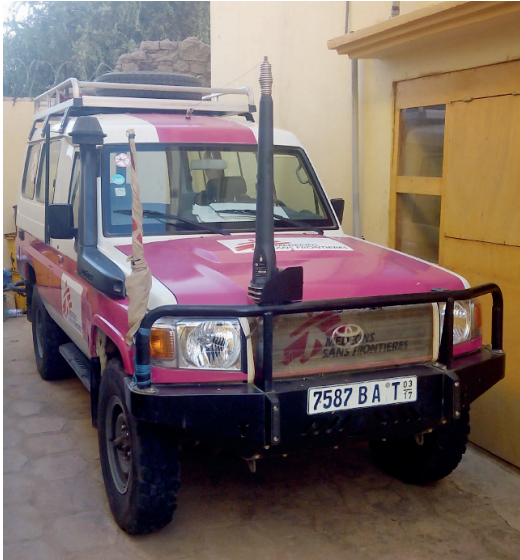
MSF vehicles in Ansongo

In MSF's view, the best way to differentiate from armed actors is to avoid collaboration